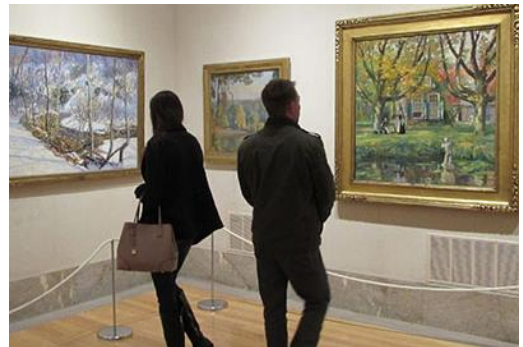
Butler Institute of American Art

Group-friendly dining for your group can also be arranged.