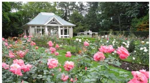
Fellows Riverside Gardens